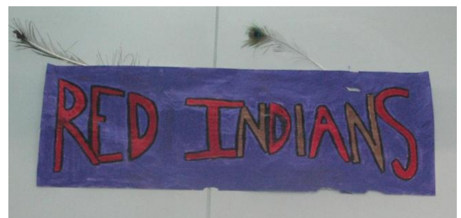
Figure 2 Banner made for us by a group of Masterton children