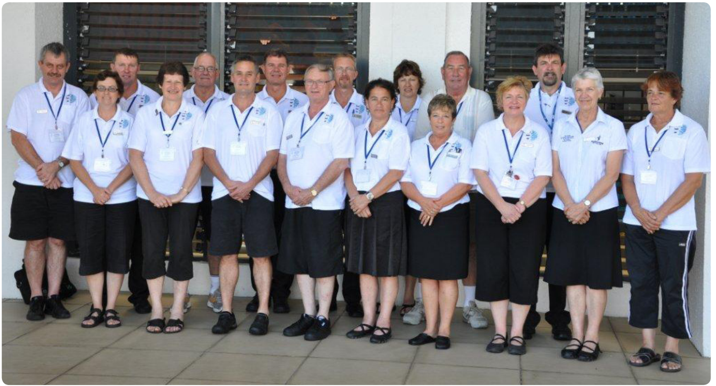
New Zealand Oceania Samoa 2010 Technical Official Team

officials in one place at one time it was a prime opportunity for FINA to verify that all technical members of the Oceania Federation are consistent from Country to Country with their interpretations of the rules. It was also an opportunity to assess that members are familiar and up to date with the most recent changes of the FINA rules. Open forum was encouraged and like most open forums, there was plenty to discuss and debate!